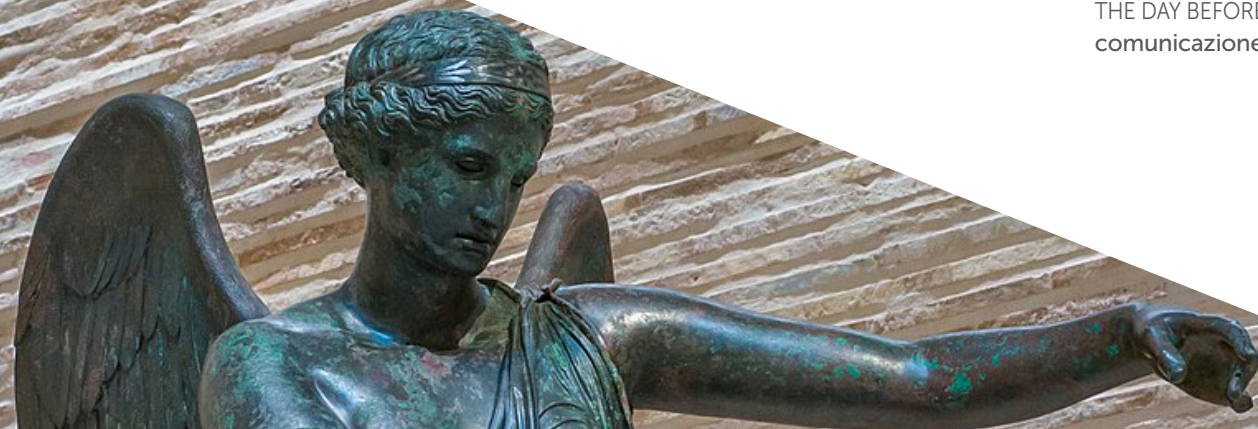
The "Vittoria Alata" of Brescia, a rare bronze Roman statue.